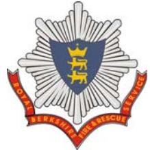
Berkshire Fire & Rescue Service