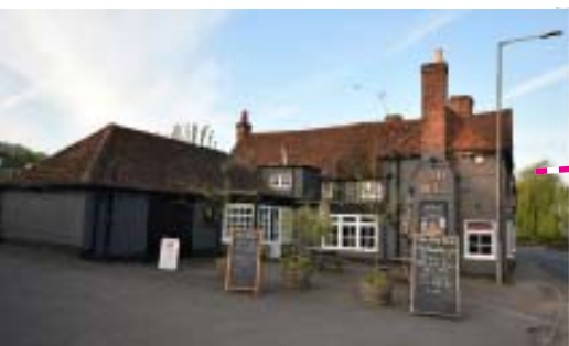
The Old Bell at Wooburn Town