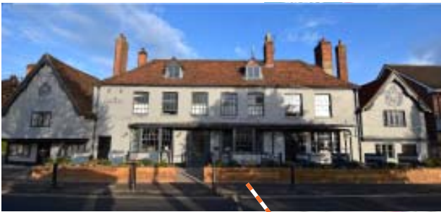
The Red Lion The Queen and Albert (re-named Grays Inn)