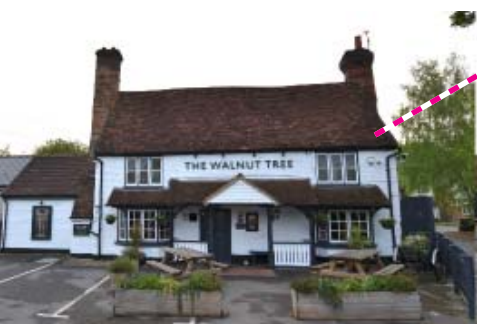
The Walnut Tree Bourne End