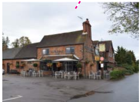
The Chequers at Widmoor

(Another Bourne End pub is the Black Lion just over the boundary with Little Marlow)